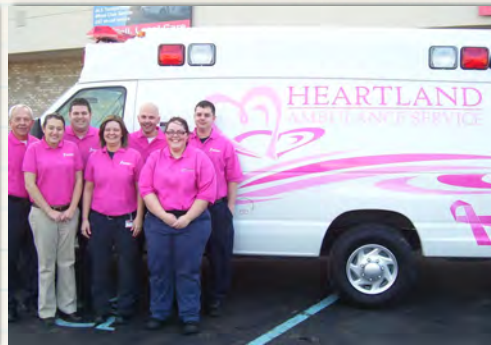
One of our new ambulance services that donate ground transport for us in Indy: Heartland Ambulance. This is their Breast Cancer Awareness Truck-with part of the proceeds made off ambulace trips donated to the breast cancer foundation!