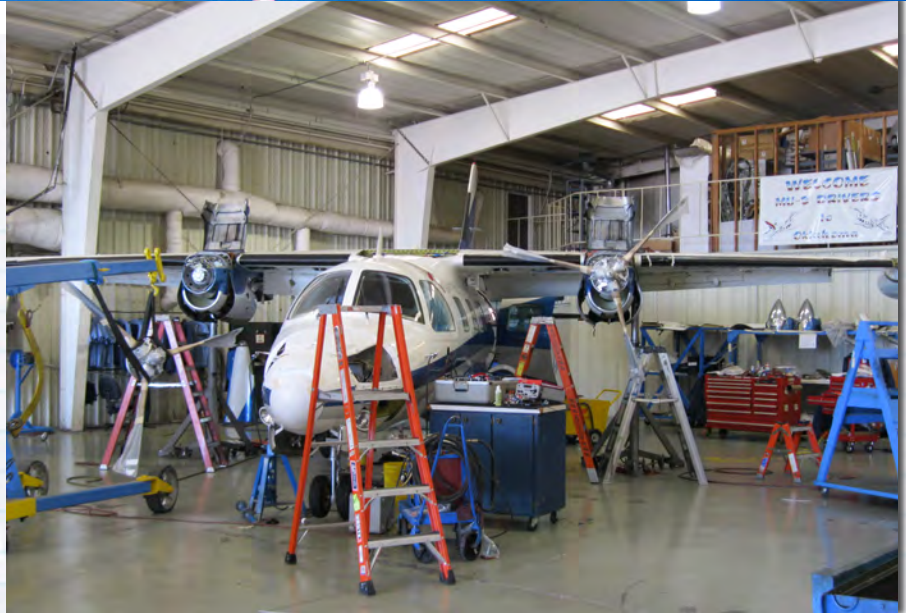
Nellie at her “spa” in Tulsa getting her new Dash 10 engines and a lot of TLC!