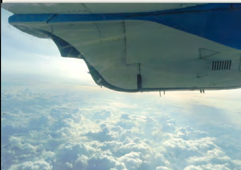
View from outside Nellie's crew window . How peaceful it is from above!