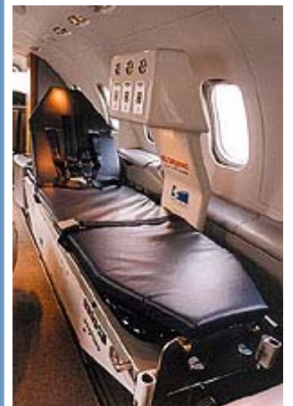
Spectromed Aircraft Cot

Why does an air-ambulance not cost $24,000 ???