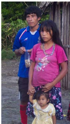
Peruvian's in need of care